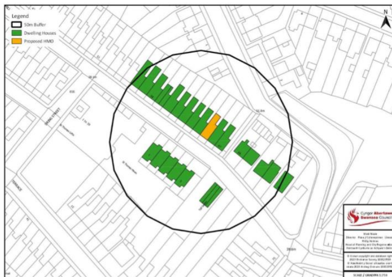
Figure 1 - HMO Concentration Radius Test

Within a 50 metre radius of the application property there are 26 residential units and according to my records no properties are existing HMOs. If the application property was approved for a HMO (Class C4) use I have calculated that on this basis the concentration percentage would be 3.85% within the 50m radius and therefore would be below the 10% threshold. See Figure 1 below: