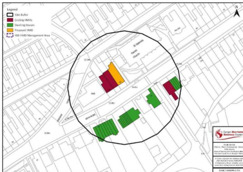
Figure 1 - HMO Concentration Radius Test

Within a 50 metre radius of the application property there are 26 residential units and according to my records 3 properties are existing HMOs. If the application property was approved for a HMO (Class C4) use I have calculated that on this basis the concentration percentage would be 15.38% within the 50m radius and therefore would be below the 25% threshold as shown in Figure 1 below: